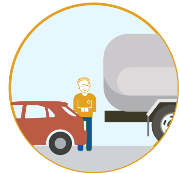
Hazards such as parked cars, people, animals, and bollard posts